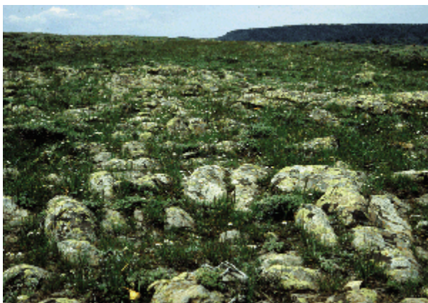
Photo Copyright © 1999 acutissima courtesy of the Colorado Natural Heritage Program

Habitat: Sandy, gravelly and rocky soils, in seasonally wet areas; in meadows, depressions, or along arroyos in mixed conifer forest to sage-brush scrub. Elev. 5300-8500 ft.