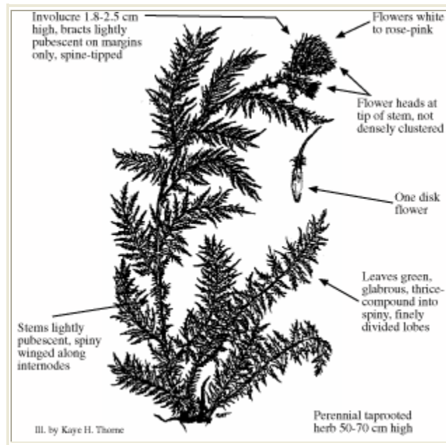
Illustration Copyright © 1999