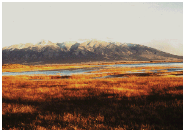
Approximation of habitat by D. Kuntz

Habitat: Actual habitat unknown but thought to be along margins of rivers and lakes. Elev. 7500 ft.