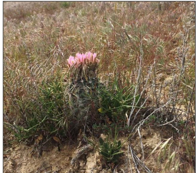
Colorado hookless cactus ( Sclerocactus glaucus , G2G3) with noxious weeds downy brome ( Bromus tectorum ) and halogeton ( Halogeton glomeratus ).

The goal of noxious weed management is to improve the value of the land, protect natural resources, and to enhance desired land uses through effective weed control. Therefore, while efforts are directed towards stopping the displacement of rare plants by noxious weeds, precautions are required to minimize unintended harm that can occur during weed management activities, such as trampling, herbicide contact, pollination disruption, and significantly altering the rare plant's habitat. Guidelines are needed to assist landowners and managers to protect rare plants at risk of local or global extinction.