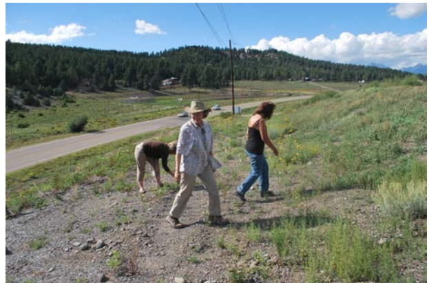
Pagosa skyrocket roadside habitat

Plant Species of Focus: Pagosa skyrocket ( Ipomopsis polyantha )