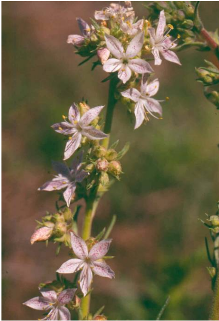
Pagosa skyrocket