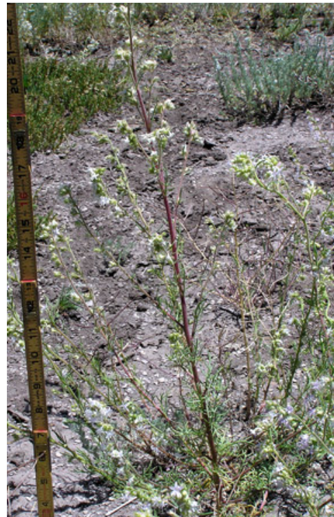
Habitat of Ipomopsis polyantha .