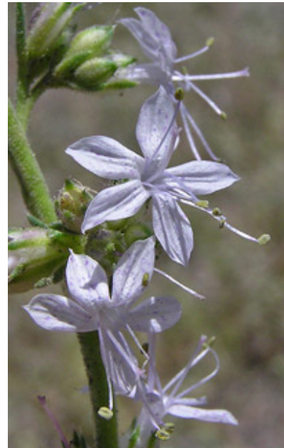
Ipomopsis polyantha .

Taxonomic Comments: Sometimes placed in the genus Gilia . As treated by Kartesz (1999), the plants sometimes called Gilia brachysiphon and G. polyantha var. whitingii are included here, without recognition of varieties or subspecies, but the species is considered by Kartesz to be endemic to Colorado. FWS tracks as Ipomopsis polyantha , but in a narrower sense, excluding the brachysiphon and whitingii plants. Colorado Natural Heritage Program botanists believe plants of their state (the typical variety) are distinct from those of New Mexico and Arizona (locality of var. whitingii ).